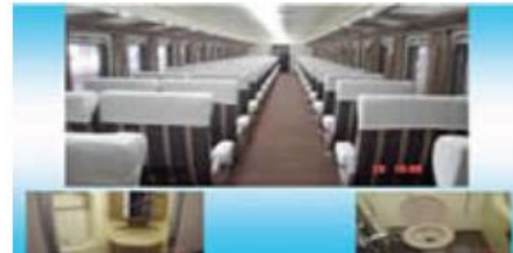
French Train Seats/Path