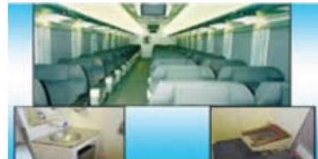
Spanish Train Seats/Path