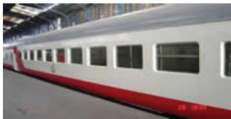
Spanish Train Carriage