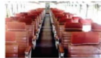
Turbine Second Class Seats