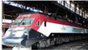
Turbine Train Carriage

Egypt has a good rail network. Egyptian trains offer six classes of accommodation: