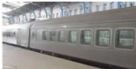
French Train Carriage