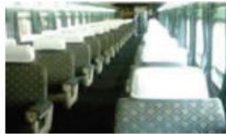
Turbine First Class Seats